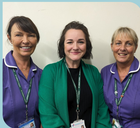
Dementia Services Team

whilst knowing your loved one is being cared for close by, offers piece of mind for carers and a much needed moment of relaxation.