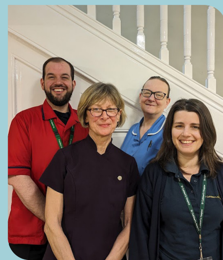
Living Well and Family Support Team

The wonderful words shared by those we support shows the special impact that caring for carers can have. We hope you enjoy reading them as much as we did.